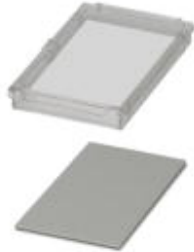
Transparent cover for installation housing BC 71,6...

Please be informed that the data shown in this PDF Document is generated from our Online Catalog. Please find the complete data in the user's documentation. Our General Terms of Use for Downloads are valid ( http://download.phoenixcontact.com )