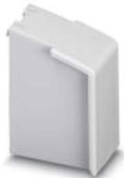
Keying tab 17.6 mm

Please be informed that the data shown in this PDF Document is generated from our Online Catalog. Please find the complete data in the user's documentation. Our General Terms of Use for Downloads are valid ( http://download.phoenixcontact.com )