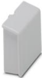
Filler plug for unoccupied terminal points, color: Light gray

Please be informed that the data shown in this PDF Document is generated from our Online Catalog. Please find the complete data in the user's documentation. Our General Terms of Use for Downloads are valid ( http://download.phoenixcontact.com )