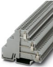
Sensor/actuator terminal block, Cross section: 0.2 mm 2 - 4 mm 2 , AWG: 24 - 12, Connection type: Screw connection, Width: 6.2 mm, Color: gray, Mounting type: NS 35/7,5, NS 35/15

Please be informed that the data shown in this PDF Document is generated from our Online Catalog. Please find the complete data in the user's documentation. Our General Terms of Use for Downloads are valid ( http://download.phoenixcontact.com )