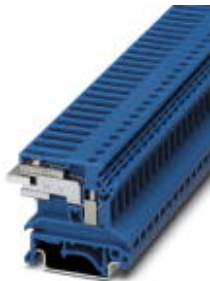
N disconnect terminal block, Special and hybrid connection, Cross section: 0.2 mm 2 - 4 mm 2 , AWG: 24 - 12, Width: 6.2 mm, Color: blue, Mounting type: NS 35/7,5, NS 35/15, NS 32

Please be informed that the data shown in this PDF Document is generated from our Online Catalog. Please find the complete data in the user's documentation. Our General Terms of Use for Downloads are valid ( http://download.phoenixcontact.com )