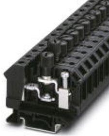
Fuse terminal block for cartridge fuse insert, cross section: 0.5 - 16 mm 2 , AWG: 24 - 6, width: 12 mm, color: black

Please be informed that the data shown in this PDF Document is generated from our Online Catalog. Please find the complete data in the user's documentation. Our General Terms of Use for Downloads are valid ( http://download.phoenixcontact.com )