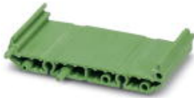
Electronic board base, plug-in module base element

Please be informed that the data shown in this PDF Document is generated from our Online Catalog. Please find the complete data in the user's documentation. Our General Terms of Use for Downloads are valid ( http://download.phoenixcontact.com )