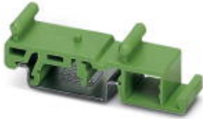
Foot element, for mounting on DIN rail NS 32 or DIN rail NS 35/7.5, can be inserted between base and side element

Please be informed that the data shown in this PDF Document is generated from our Online Catalog. Please find the complete data in the user's documentation. Our General Terms of Use for Downloads are valid ( http://download.phoenixcontact.com )