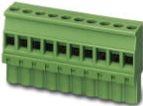
Plug component, Nominal current: 12 A, Rated voltage (III/2): 320 V, Number of positions: 8, Pitch: 5 mm, Connection method: Screw connection, Color: green, Contact surface: Tin

Please be informed that the data shown in this PDF Document is generated from our Online Catalog. Please find the complete data in the user's documentation. Our General Terms of Use for Downloads are valid ( http://download.phoenixcontact.com )