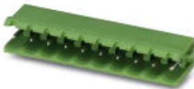
Header, Nominal current: 12 A, Rated voltage (III/2): 320 V, Number of positions: 2, Pitch: 5.08 mm, Color: green, Contact surface: Tin, Assembly: Soldering

Please be informed that the data shown in this PDF Document is generated from our Online Catalog. Please find the complete data in the user's documentation. Our General Terms of Use for Downloads are valid ( http://download.phoenixcontact.com )