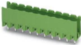
Header, Nominal current: 12 A, Rated voltage (III/2): 320 V, Number of positions: 9, Pitch: 5.08 mm, Color: green, Contact surface: Tin, Assembly: Soldering

Please be informed that the data shown in this PDF Document is generated from our Online Catalog. Please find the complete data in the user's documentation. Our General Terms of Use for Downloads are valid ( http://download.phoenixcontact.com )