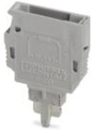
Component connector, Nominal current: 6 A, Length: 24 mm, Width: 5.2 mm, Height: 22 mm, Color: gray

Please be informed that the data shown in this PDF Document is generated from our Online Catalog. Please find the complete data in the user's documentation. Our General Terms of Use for Downloads are valid ( http://download.phoenixcontact.com )