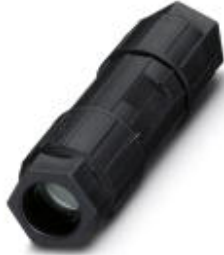
QUICKON conductor connector, 4-pos., connection cross section 0.34-0.75 mm 2

Please be informed that the data shown in this PDF Document is generated from our Online Catalog. Please find the complete data in the user's documentation. Our General Terms of Use for Downloads are valid ( http://download.phoenixcontact.com )