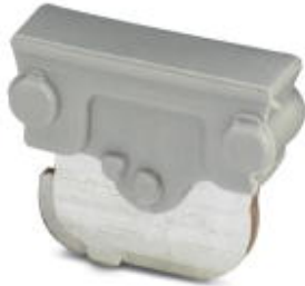
Spare knife, Length: 10.5 mm, Width: 4 mm, Color: gray

Please be informed that the data shown in this PDF Document is generated from our Online Catalog. Please find the complete data in the user's documentation. Our General Terms of Use for Downloads are valid ( http://download.phoenixcontact.com )