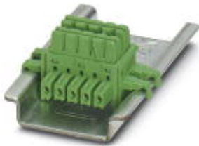
DIN rail connector for DIN rail mounting. Universal for TBUS housing. Gold-plated contacts, 5-pos.

Please be informed that the data shown in this PDF Document is generated from our Online Catalog. Please find the complete data in the user's documentation. Our General Terms of Use for Downloads are valid ( http://download.phoenixcontact.com )