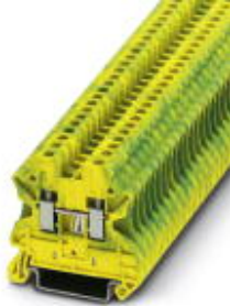
Feed-through terminal block, Connection method: Screw connection, Cross section: 0.14 mm 2 - 4 mm 2 , AWG: 26 - 12, Width: 5.2 mm, Color: green-yellow, Mounting type: NS 35/7,5, NS 35/15

Please be informed that the data shown in this PDF Document is generated from our Online Catalog. Please find the complete data in the user's documentation. Our General Terms of Use for Downloads are valid ( http://download.phoenixcontact.com )