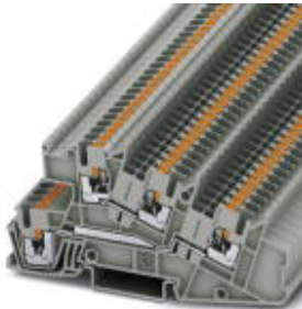
Installation level terminal block, Push-in connection, Cross section: 0.14 mm 2 - 4 mm 2 , AWG: 26 - 12, Width: 5.2 mm, Color: gray, Mounting type: NS 35/7,5, NS 35/15

Please be informed that the data shown in this PDF Document is generated from our Online Catalog. Please find the complete data in the user's documentation. Our General Terms of Use for Downloads are valid ( http://download.phoenixcontact.com )