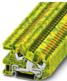
Installation terminal block, Push-in connection, Cross section: 0.2 mm 2 - 6 mm 2 , AWG: 24 - 10, Width: 6.2 mm, Color: green-yellow, Mounting type: NS 35/7,5, NS 35/15

Please be informed that the data shown in this PDF Document is generated from our Online Catalog. Please find the complete data in the user's documentation. Our General Terms of Use for Downloads are valid ( http://download.phoenixcontact.com )