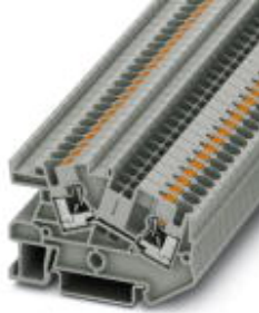
Connection terminal block, Push-in connection, Cross section: 0.2 mm 2 - 6 mm 2 , AWG: 24 - 10, Width: 6.2 mm, Color: gray, Mounting type: NS 35/7,5, NS 35/15

Please be informed that the data shown in this PDF Document is generated from our Online Catalog. Please find the complete data in the user's documentation. Our General Terms of Use for Downloads are valid ( http://download.phoenixcontact.com )