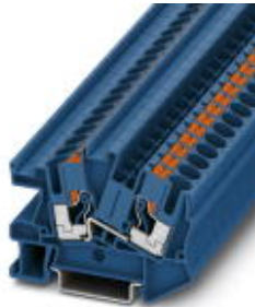
Installation terminal block, Push-in connection, Cross section: 0.5 mm 2 - 10 mm 2 , AWG: 20 - 8, Width: 8.2 mm, Color: blue, Mounting type: NS 35/7,5, NS 35/15

Please be informed that the data shown in this PDF Document is generated from our Online Catalog. Please find the complete data in the user's documentation. Our General Terms of Use for Downloads are valid ( http://download.phoenixcontact.com )