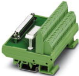
VARIOFACE module, with screw connection and D-Subminiature socket strip, for mounting on NS 35/7.5 or NS 32, 37-pos.

Please be informed that the data shown in this PDF Document is generated from our Online Catalog. Please find the complete data in the user's documentation. Our General Terms of Use for Downloads are valid ( http://download.phoenixcontact.com )