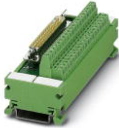
VARIOFACE module, with screw connection and D-subminiature pin strip, for assembly on NS 35/7.5, 37 positions

Please be informed that the data shown in this PDF Document is generated from our Online Catalog. Please find the complete data in the user's documentation. Our General Terms of Use for Downloads are valid ( http://download.phoenixcontact.com )