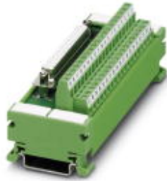
VARIOFACE module, with screw connection and D-subminiature socket strip, for assembly on NS 35/7.5, 37 positions

Please be informed that the data shown in this PDF Document is generated from our Online Catalog. Please find the complete data in the user's documentation. Our General Terms of Use for Downloads are valid ( http://download.phoenixcontact.com )