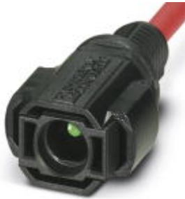
Photovoltaic connector, Nominal current: 27 A, Nom. voltage: 1500 V, Connection type: Crimp, Color: black, Can only be released using a tool

Please be informed that the data shown in this PDF Document is generated from our Online Catalog. Please find the complete data in the user's documentation. Our General Terms of Use for Downloads are valid ( http://download.phoenixcontact.com )