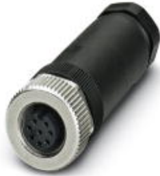
Sensor/actuator connector, female, straight, 8-pos., M12, A-coded, screw connection, metal knurl, cable screw connection Pg9

Please be informed that the data shown in this PDF Document is generated from our Online Catalog. Please find the complete data in the user's documentation. Our General Terms of Use for Downloads are valid ( http://download.phoenixcontact.com )