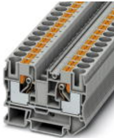
Feed-through terminal block, Connection method: Push-in connection, Cross section: 0.5 mm 2 - 16 mm 2 , AWG: 20 - 6, Width: 10.2 mm, Height: 49.5 mm, Color: gray, Mounting type: NS 35/7,5, NS 35/15

Please be informed that the data shown in this PDF Document is generated from our Online Catalog. Please find the complete data in the user's documentation. Our General Terms of Use for Downloads are valid ( http://download.phoenixcontact.com )