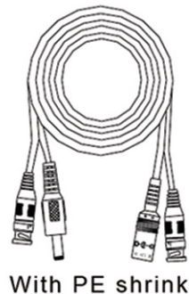
With PE shrink