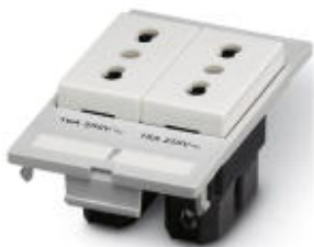
Ground contact socket, exclusively for service interface order no. 1656482 and 1656495, plastic, for Italy

Please be informed that the data shown in this PDF Document is generated from our Online Catalog. Please find the complete data in the user's documentation. Our General Terms of Use for Downloads are valid ( http://download.phoenixcontact.com )