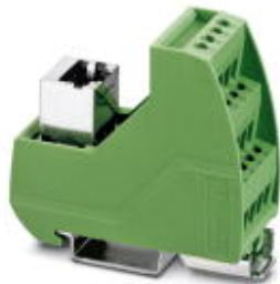
VARIOFACE module with screw connection and RJ45 connector

Please be informed that the data shown in this PDF Document is generated from our Online Catalog. Please find the complete data in the user's documentation. Our General Terms of Use for Downloads are valid ( http://download.phoenixcontact.com )