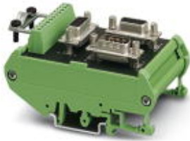
Passive RS-485 T-distributor, fitted with one 9-pin D-SUB pin strip and two 9-pin D-SUB socket strips

Please be informed that the data shown in this PDF Document is generated from our Online Catalog. Please find the complete data in the user's documentation. Our General Terms of Use for Downloads are valid ( http://download.phoenixcontact.com )