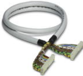
Round cable sets, with two 40-pos. socket strips (1:1 connection), also for use with Siemens SIMATIC® S5-95U and 100U (32 x digital IN/OUT), cable length: 2 m

Please be informed that the data shown in this PDF Document is generated from our Online Catalog. Please find the complete data in the user's documentation. Our General Terms of Use for Downloads are valid ( http://download.phoenixcontact.com )