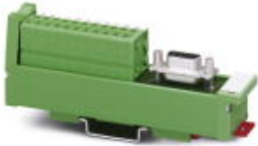
VARIOFACE SLIM LINE, with screw connection and D-subminiature socket strip, for assembly at a right angle on NS 35/7.5, 9 positions

Please be informed that the data shown in this PDF Document is generated from our Online Catalog. Please find the complete data in the user's documentation. Our General Terms of Use for Downloads are valid ( http://download.phoenixcontact.com )