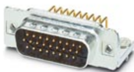
D-SUB contact insert, shell size 2, with 26 signal contacts, contact type pin, for PCB assembly, angled, fixing with 4-40 UNC thread and solder pins, for panel mounting frame VS-15-...

Please be informed that the data shown in this PDF Document is generated from our Online Catalog. Please find the complete data in the user's documentation. Our General Terms of Use for Downloads are valid ( http://download.phoenixcontact.com )