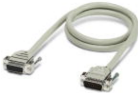
Round shielded cable set, with 37-pos. D-SUB female and male connectors, cable length: 3 m

Please be informed that the data shown in this PDF Document is generated from our Online Catalog. Please find the complete data in the user's documentation. Our General Terms of Use for Downloads are valid ( http://download.phoenixcontact.com )