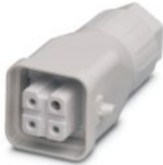
HEAVYCON QUICKON sleeve housing A3, for single locking latch, 3-pos., with PE connection, socket, QUICKON connection, straight cable outlet

Please be informed that the data shown in this PDF Document is generated from our Online Catalog. Please find the complete data in the user's documentation. Our General Terms of Use for Downloads are valid ( http://download.phoenixcontact.com )