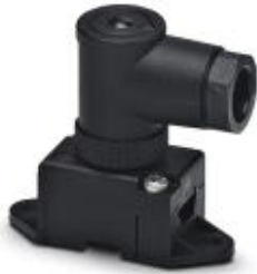
AS-Interface distributor with IP67 protection for 1 flat-ribbon conductor, 2-pos., with screw connection, angled

Please be informed that the data shown in this PDF Document is generated from our Online Catalog. Please find the complete data in the user's documentation. Our General Terms of Use for Downloads are valid ( http://download.phoenixcontact.com )