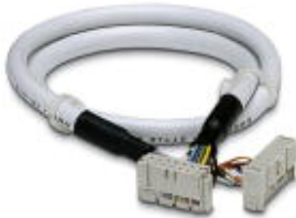
Assembled round cable set, for front adapter of the Siemens SIMATIC® "TOP connect" series, with one 16-pos. and one 14-pos. socket strip, for connecting 8 channels, cable length: 2 m

Please be informed that the data shown in this PDF Document is generated from our Online Catalog. Please find the complete data in the user's documentation. Our General Terms of Use for Downloads are valid ( http://download.phoenixcontact.com )