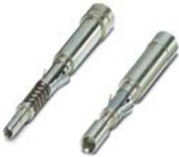
Fiber optic pin contact POF, turned, for contact carriers of CK1,6-ED... contacts

Please be informed that the data shown in this PDF Document is generated from our Online Catalog. Please find the complete data in the user's documentation. Our General Terms of Use for Downloads are valid ( http://download.phoenixcontact.com )