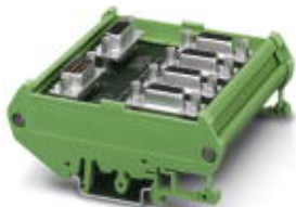
Passive RS-485 T-distributor, fitted with one 9-pin D-SUB pin strip and five 9-pin D-SUB socket strips

Please be informed that the data shown in this PDF Document is generated from our Online Catalog. Please find the complete data in the user's documentation. Our General Terms of Use for Downloads are valid ( http://download.phoenixcontact.com )