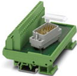
VARIOFACE module, for ELCO connector, for mounting on NS 35/7.5 or NS 32, with pin strip 8016 left, no. of positions 38

Please be informed that the data shown in this PDF Document is generated from our Online Catalog. Please find the complete data in the user's documentation. Our General Terms of Use for Downloads are valid ( http://download.phoenixcontact.com )