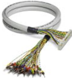
Round cable assembled with a 14-pos. socket strip and an open end. On the open end, the wires are labeled with 1 to 14 and have ferrules, cable length: 2 m

Please be informed that the data shown in this PDF Document is generated from our Online Catalog. Please find the complete data in the user's documentation. Our General Terms of Use for Downloads are valid ( http://download.phoenixcontact.com )