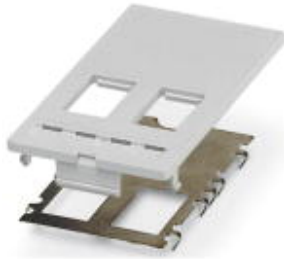
Front plate, plastic with shroud, for 2x RJ with modular system (Keystone)

Please be informed that the data shown in this PDF Document is generated from our Online Catalog. Please find the complete data in the user's documentation. Our General Terms of Use for Downloads are valid ( http://download.phoenixcontact.com )