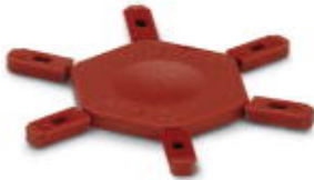
Coding profile, Number of positions: 1, Color: red

Please be informed that the data shown in this PDF Document is generated from our Online Catalog. Please find the complete data in the user's documentation. Our General Terms of Use for Downloads are valid ( http://download.phoenixcontact.com )