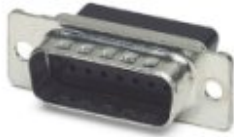
D-SUB contact carrier, shell size 2, for 15 signal contacts, contact type pin, for crimp contacts, straight, fixing with a 3 mm hole, for panel mounting frame and sleeve housing VS-15-...

Please be informed that the data shown in this PDF Document is generated from our Online Catalog. Please find the complete data in the user's documentation. Our General Terms of Use for Downloads are valid ( http://download.phoenixcontact.com )