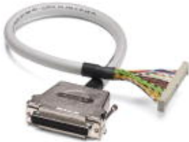
System cable for Mitsubishi Electric MELSEC Q Y81P, MELSEC A1S Y81, MELSEC A AY82EP, cable length 2.0 m

Please be informed that the data shown in this PDF Document is generated from our Online Catalog. Please find the complete data in the user's documentation. Our General Terms of Use for Downloads are valid ( http://download.phoenixcontact.com )