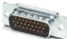
D-SUB contact insert, shell size 2, with 26 signal contacts, contact type pin, with solder cup, straight, fixing with a 3 mm hole, for panel mounting frame and sleeve housing VS-15-...

Please be informed that the data shown in this PDF Document is generated from our Online Catalog. Please find the complete data in the user's documentation. Our General Terms of Use for Downloads are valid ( http://download.phoenixcontact.com )