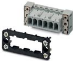
Contact insert set for mounting side, sleeve frame with PE, 4 fixing screws, 2-pos. contact inserts preassembled, 6 coding profiles, 2 mounting flanges

Please be informed that the data shown in this PDF Document is generated from our Online Catalog. Please find the complete data in the user's documentation. Our General Terms of Use for Downloads are valid ( http://download.phoenixcontact.com )