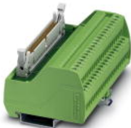
VARIOFACE interface module for Siemens SIMATIC® S7-300, with SIMATIC®-specific labeling (1 - 40), with screw connection, module width: 106.1 mm

Please be informed that the data shown in this PDF Document is generated from our Online Catalog. Please find the complete data in the user's documentation. Our General Terms of Use for Downloads are valid ( http://download.phoenixcontact.com )