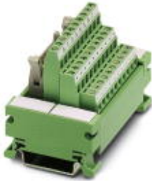
VARIOFACE COMPACT LINE, sensor module for the connection of 8 p-n-p sensors, for assembly on DIN rail NS 35/7.5, screw connection

Please be informed that the data shown in this PDF Document is generated from our Online Catalog. Please find the complete data in the user's documentation. Our General Terms of Use for Downloads are valid ( http://download.phoenixcontact.com )