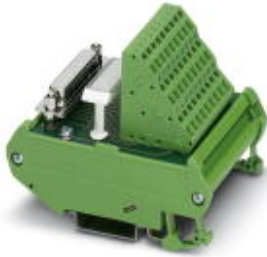
VARIOFACE module, with spring-cage connection and D-Subminiature socket strip, for mounting on NS 35/7.5 or NS 32, 25-pos.

Please be informed that the data shown in this PDF Document is generated from our Online Catalog. Please find the complete data in the user's documentation. Our General Terms of Use for Downloads are valid ( http://download.phoenixcontact.com )